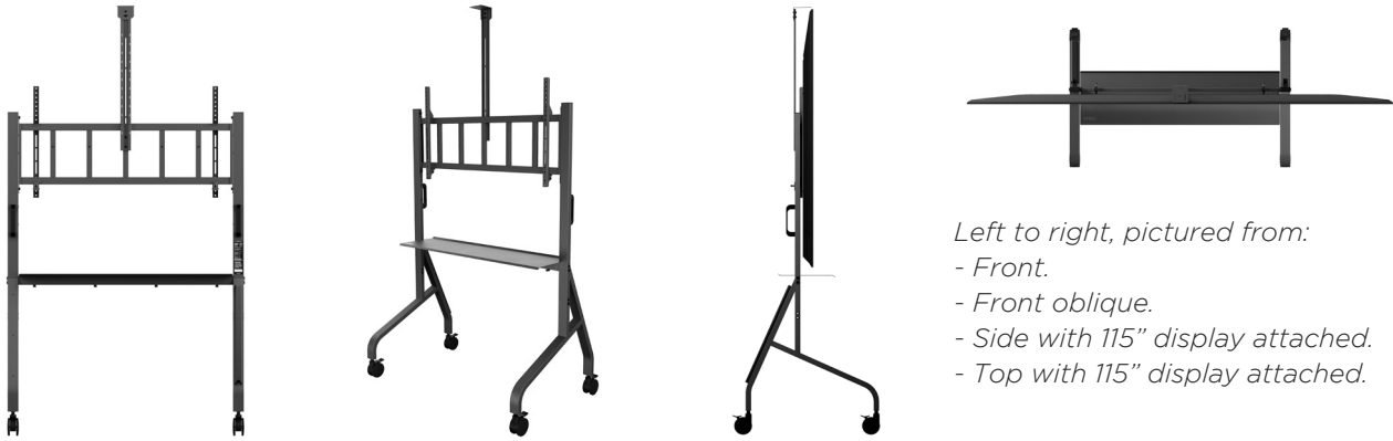
Left to right, pictured from: - Front. - Front oblique. - Side with 115" display attached. - Top with 115" display attached.